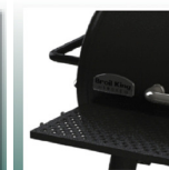
Durable Front Shelf