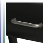
Heavy Duty Handles