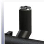
Dialed Damper System